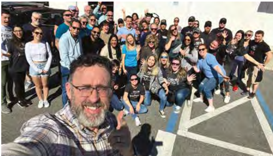
Aeon Partners on a tour of Aeon Laser USA HQ in Melbourne, FL

When you purchase an Aeon Laser, you instantly become part of our extended family. With 9600+ members, our online community has become a knowledge exchange, where successful business owners and laser enthusiasts can openly share their projects, ideas and experiences. Whether it's figuring out which markets to pursue or how to handle a late night distress call, you'll never have to go it alone.