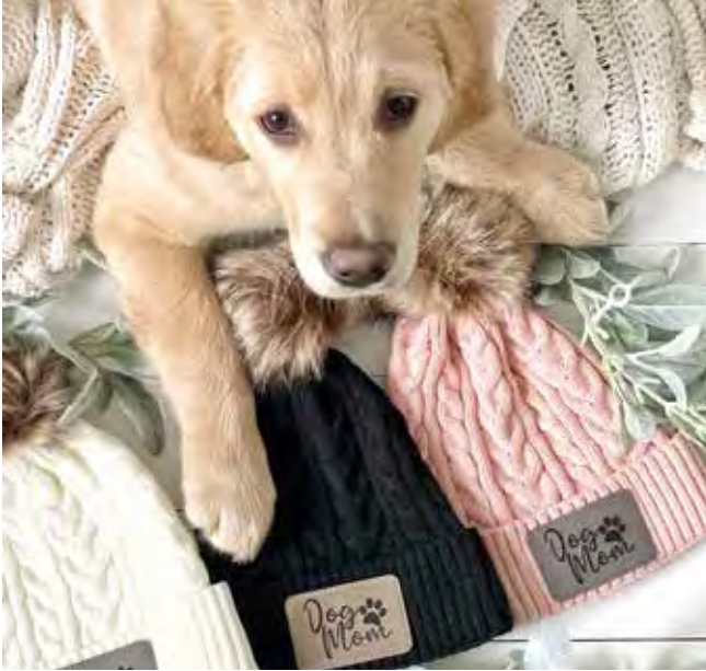
Baileys Branches (@BaileysBranches)