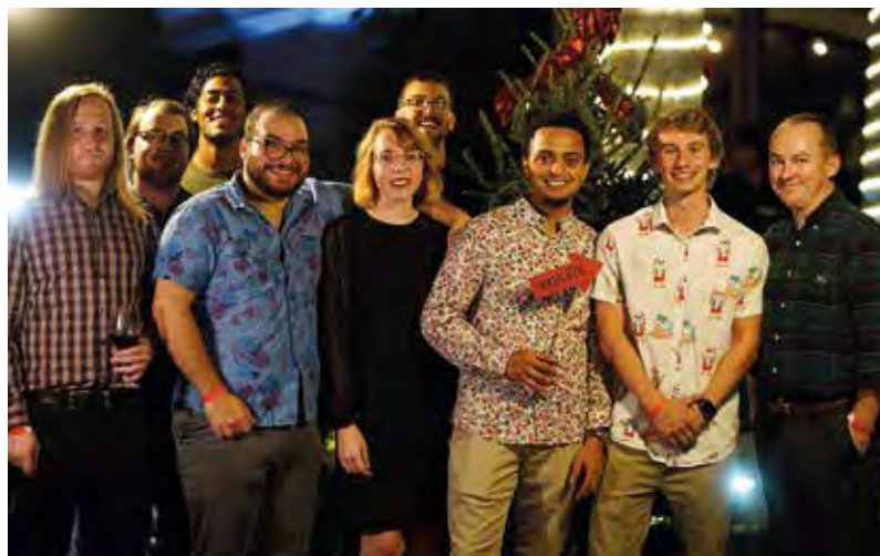
Just some of our wonderful, ever-growing staff!