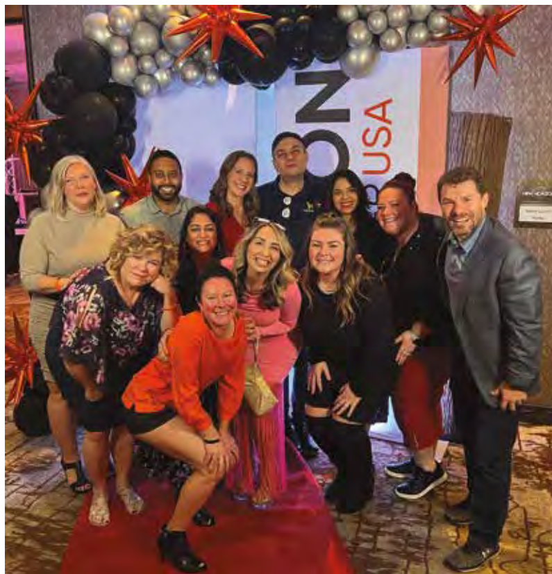
Aeon family enjoying the Aeon Laser USA holiday party

We’re also advocates of lifelong learning and mentoring. True mastery requires everlasting guidance and we’re devoted to empowering our family members so that they can achieve their utmost potential.