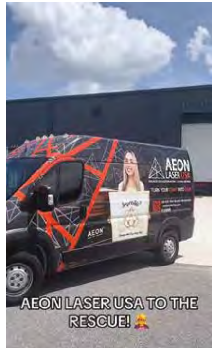
Aeon Laser USA Support Van to its way to help a customer.