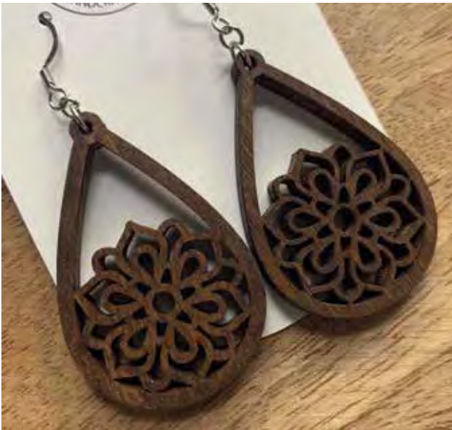
River Barn Designs (@Riverbarndesigns)